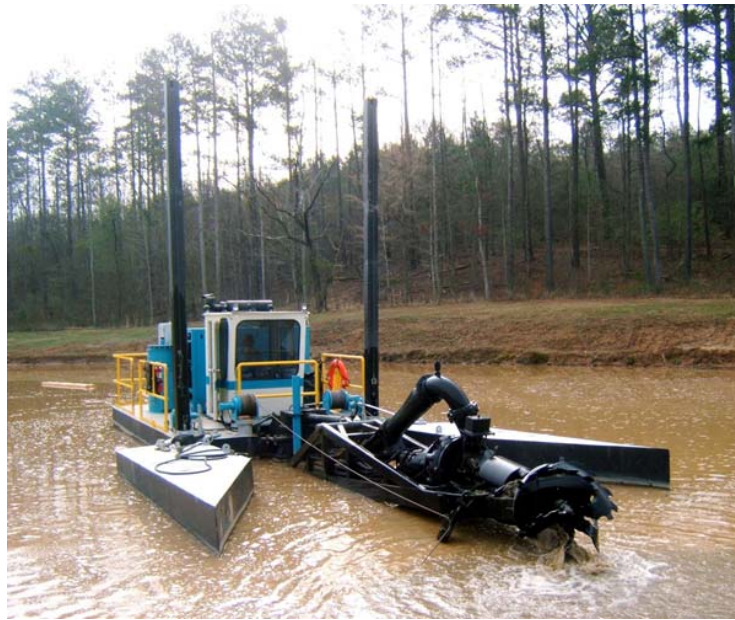
Figure 3. Dredging Supply Company 8-inch-diameter Dredge “Moray”