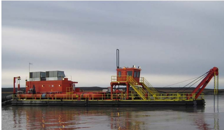
Figure 2. Dredging Supply Company 14-inch-diameter Dredge “Shark”