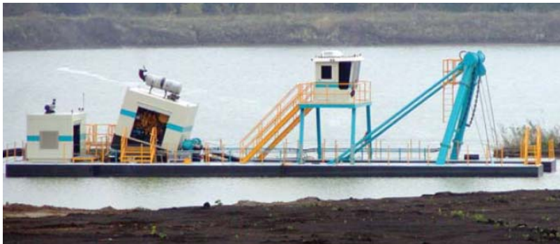
Figure 1. Dredging Supply Company 16-inch-diameter Dredge “Marlin”