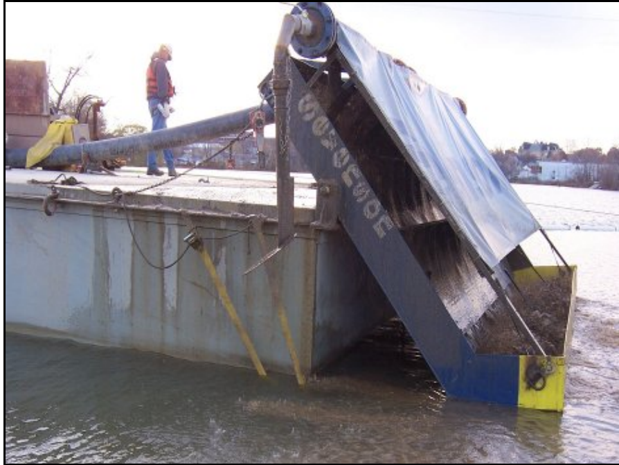
Figure 1. SES Spreader Barge System Placing Sand Cap Materials.