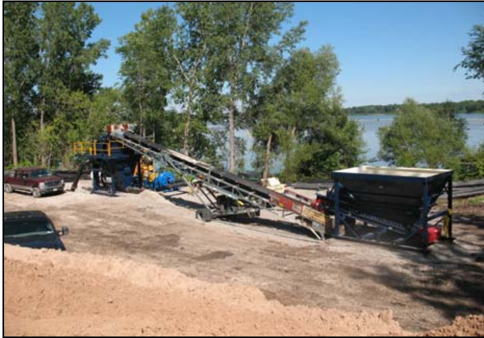
Figure 3. Slurry Feed System that Transport Materials to the Spreader Barge

The anticipated production rate that Severson calculated for each cap area is based on the pumping distance to the site from the shoreline and any inefficiencies associated with moving anchors, maintenance, shift changes, weather delays, fueling, and material stockpiling logistics. The anticipated uptime is estimated to be 80% of a 24 hour work day.