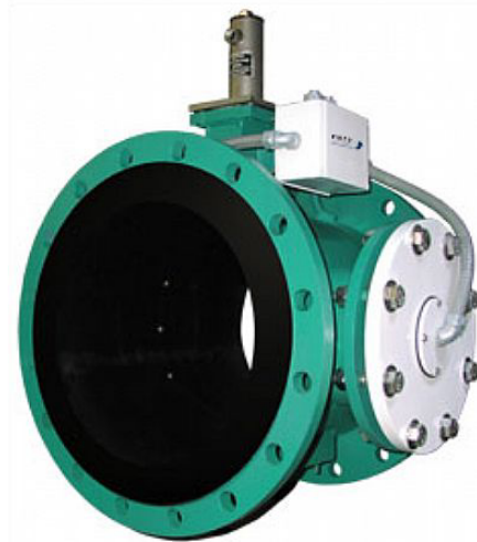
Figure 4. Delta Mass Instrument

Each hydraulic dredge will be fitted with a DeltaMass MT Series Mass Flow and Density Sensor (one unit). The DeltaMass flow meter combines a magnetic flow meter and a low-level gamma ray density sensor for measuring the density of the slurry and the flow rates, which together provide the instantaneous production rate of material being removed. This information will be visible to the operator so that he can control the flow in the pipeline to achieve a uniform slurry. Output from these two gauges will be fed into a “Totalizer Unit”, which will keep track of the total quantity of material dredged in real-time.