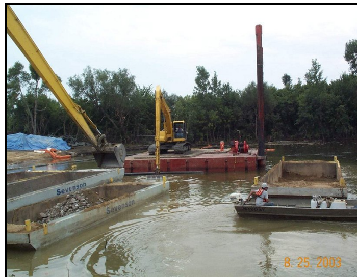
Figure 4. Mechanical Placement of Rock Cap Materials from a Shallow Draft Barge

Production rates for mechanical placement of armor materials larger than 2 inches in diameter are calculated to be approximately 50 CY/HR. These production rates account for uptime/downtime, repositioning barges, etc. Severson plans to operate 2 crews each working two 12 hour shifts. Severson anticipates an uptime of 80%.