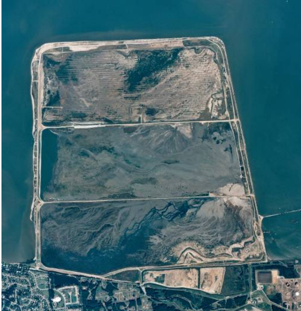
Figure 1 Example Site – Settling Basin