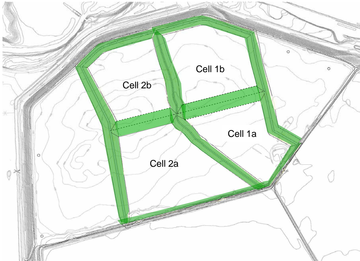
Figure 3 Settling Basin Conceptual Design