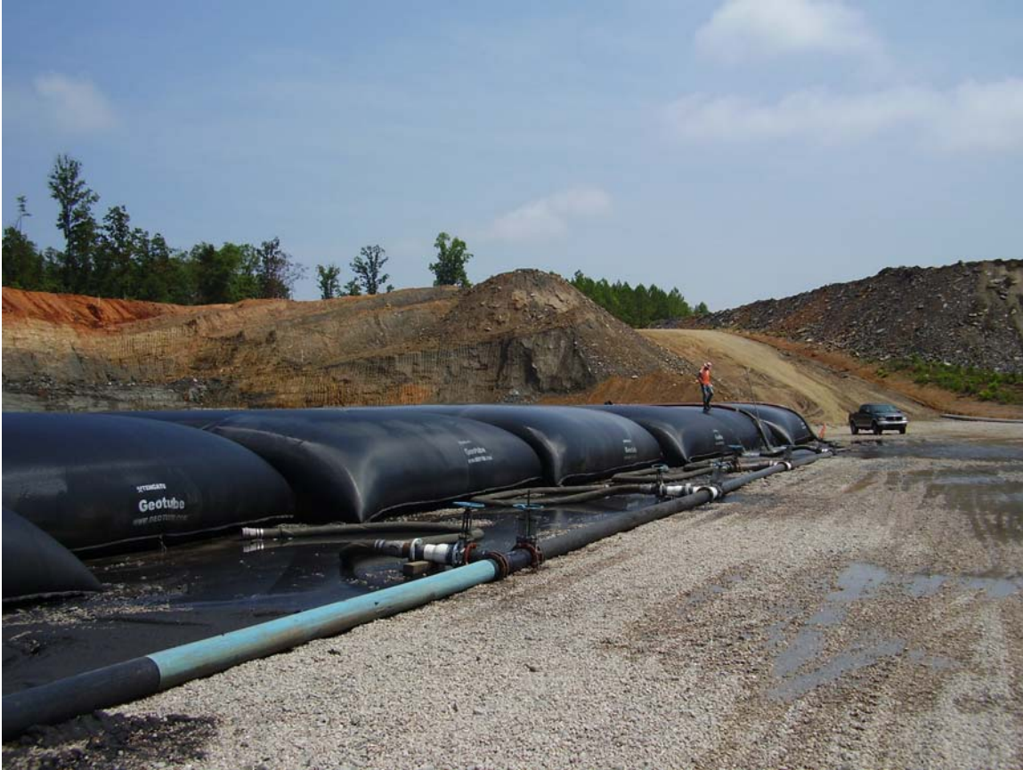
Figure 2 Example Site – Geotextile Tube Dewatering