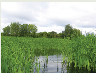
HABITAT / PLANTS / WETLANDS 87,545 plants, shrubs, and trees planted.