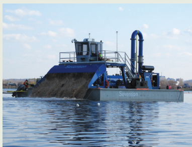
CAPPING 6,000 cubic yards of capping material placed.