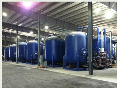
WATER TREATED Completed